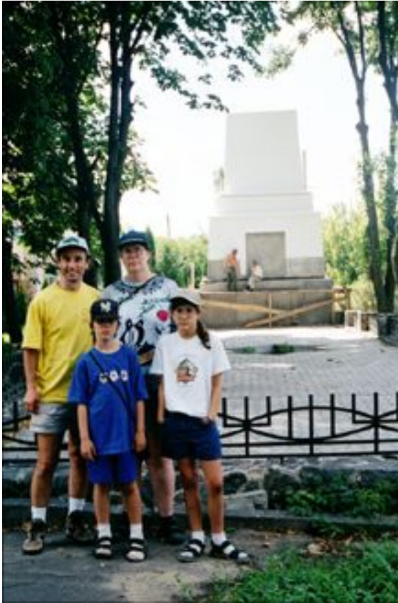
Mass grave of Jews murdered in 1919 Proskurov pogrom.