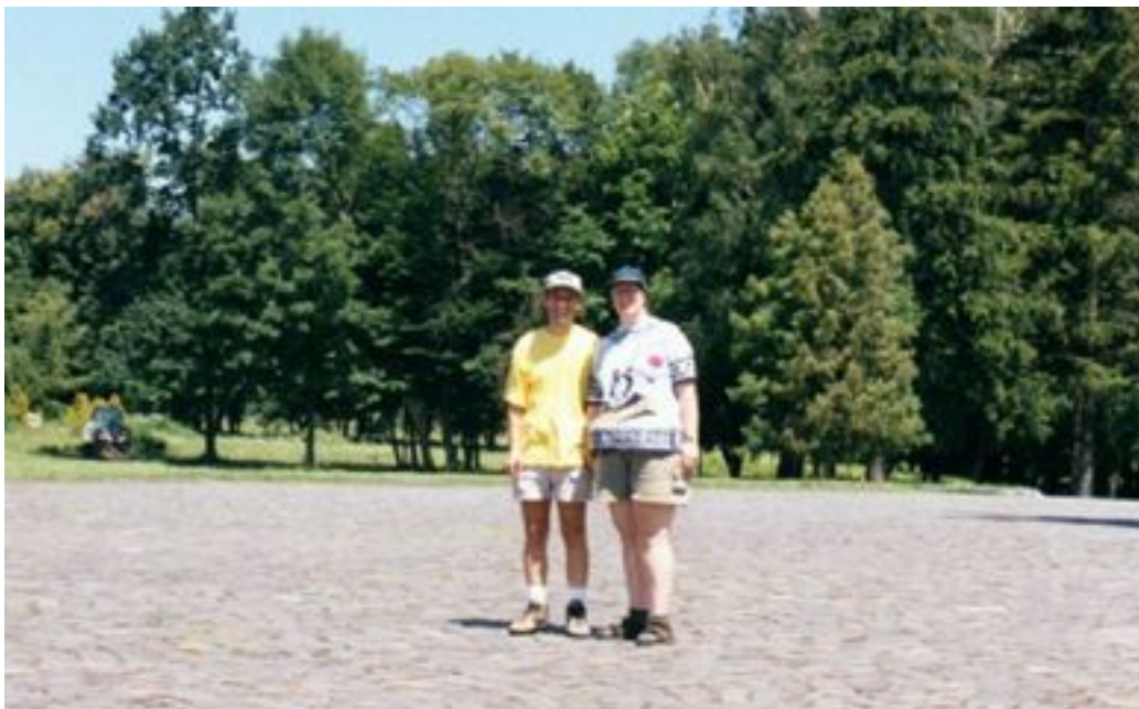
Newlyweds of 11 years in Khmel'nitsky.