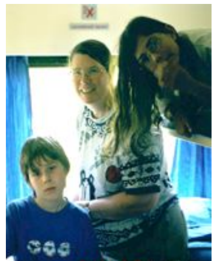
First morning in the Ukraine.

Heard from the State Agrarian and Engineering Academy (SAEA) just before driving out to SLAC for the summer.