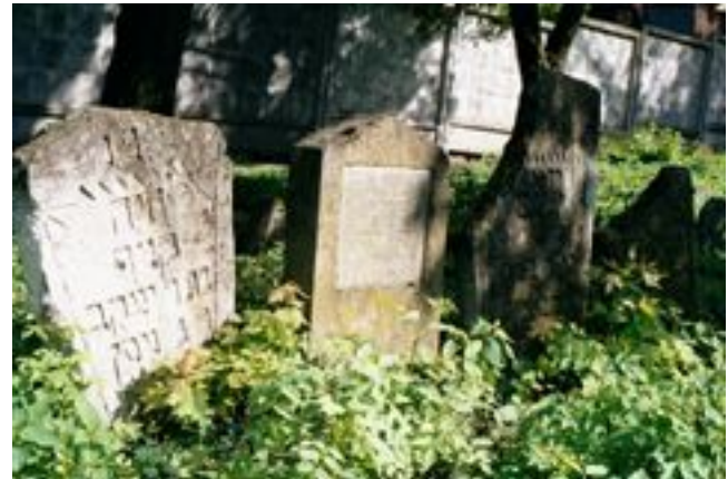
Proskurov (Khmelnitsky) Jewish Cemetery.

Time out. Anna just brought up our milk and fresh currants and sour cherries from market. Just rinsed them off in boiled water and am going to have breakfast.