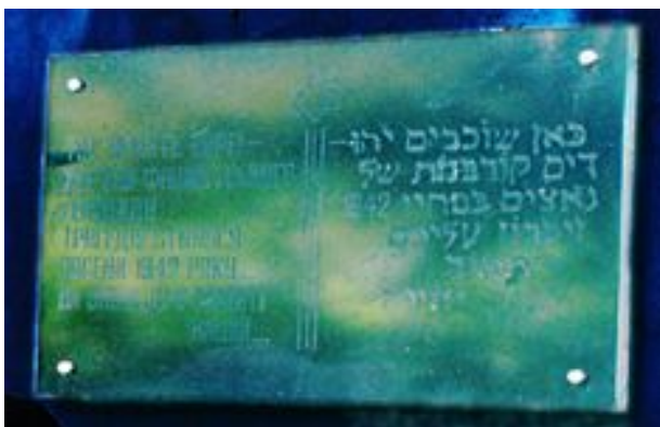
Detail of plaque on the memorial.