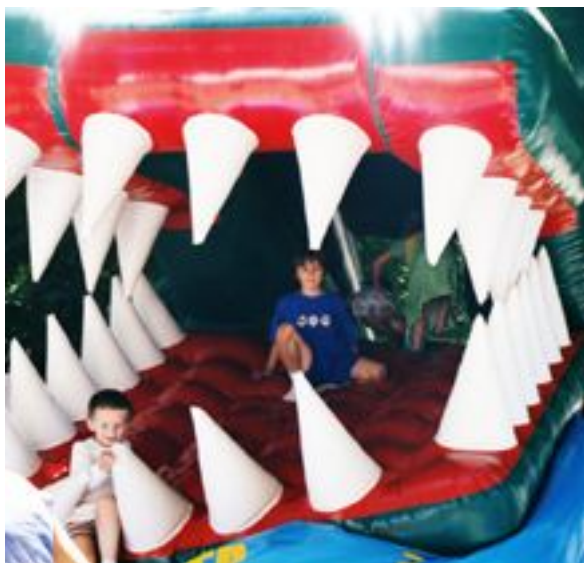
Jack and the Dragon at the Khmelnytsky pedestrian mall.