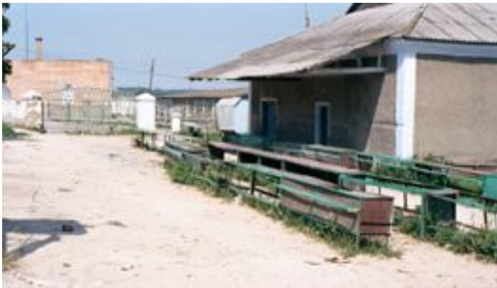
Smaller market across the street from the large market.