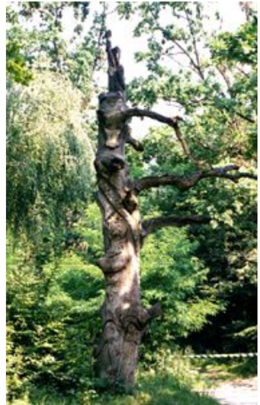
An interestingly carved tree near the entrance to the second memorial. No indication of the artist, or whether it has anything to do with the memorial.