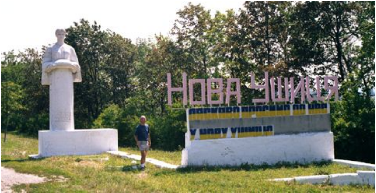
The entrance to Novaya Ushitsa.