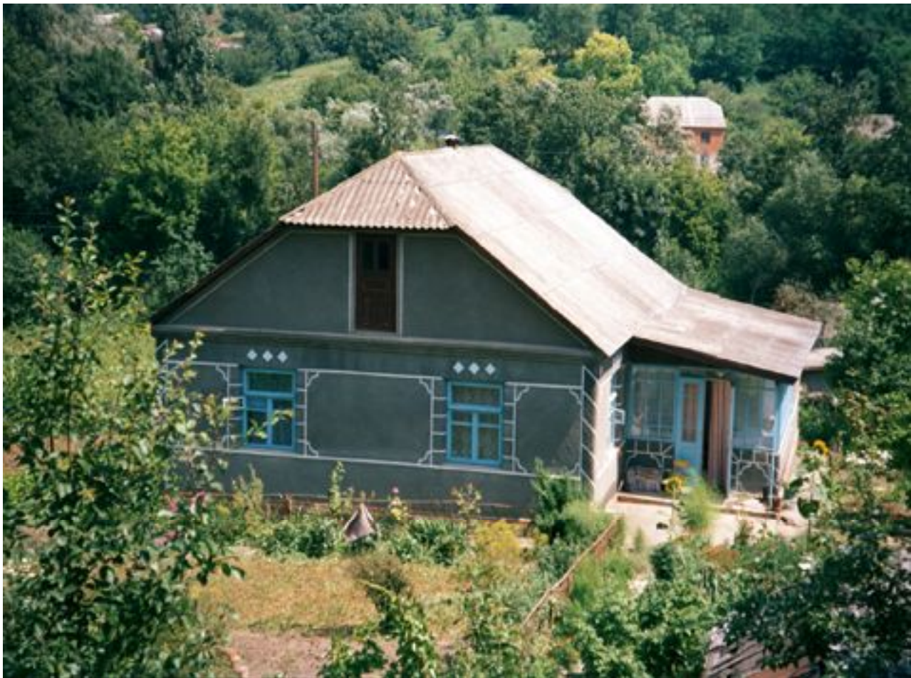
House with a Podolian style roof below road to the cemetery.