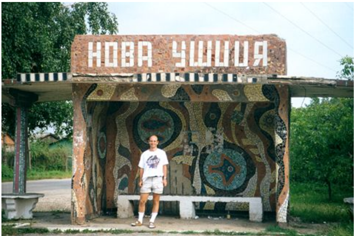
Novaya Ushitsa bus stop. (Photo taken a different day.)

journal much as I wrote at the time, inaccuracies and all. A big part of this experience for me was sifting through the information and figuring out the story of my family.