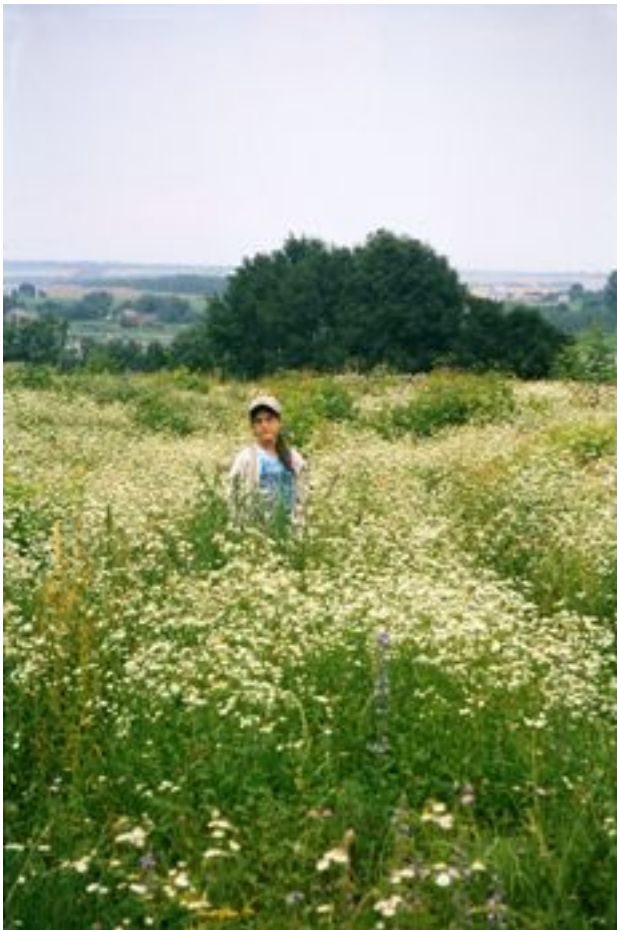
On the way to Novava Ushitsa.