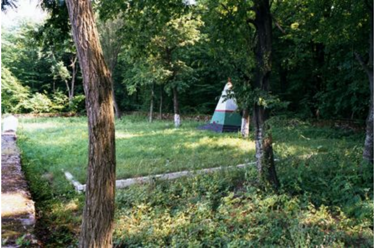
The Trikhov Forest mass-murder site outside of Novaya Ushitsa. The location of the open pit graves is now marked by white rectangular borders on the ground.