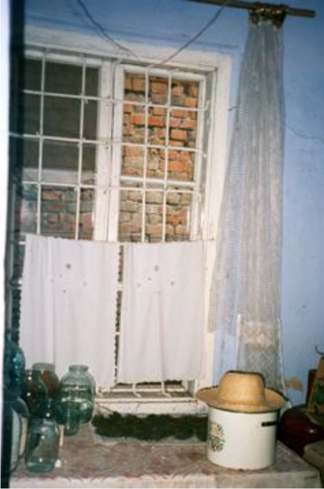
Window through which the Zigfelmans sold bread when the house operated as a bakery.