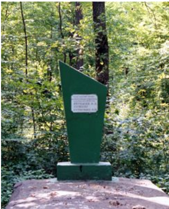
Another memorial in Trikhov forest where a smaller number of Jews were murdered.