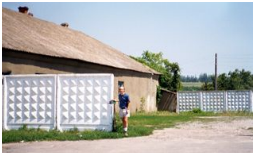
Place where Bubbie may have come to dance with other young people.