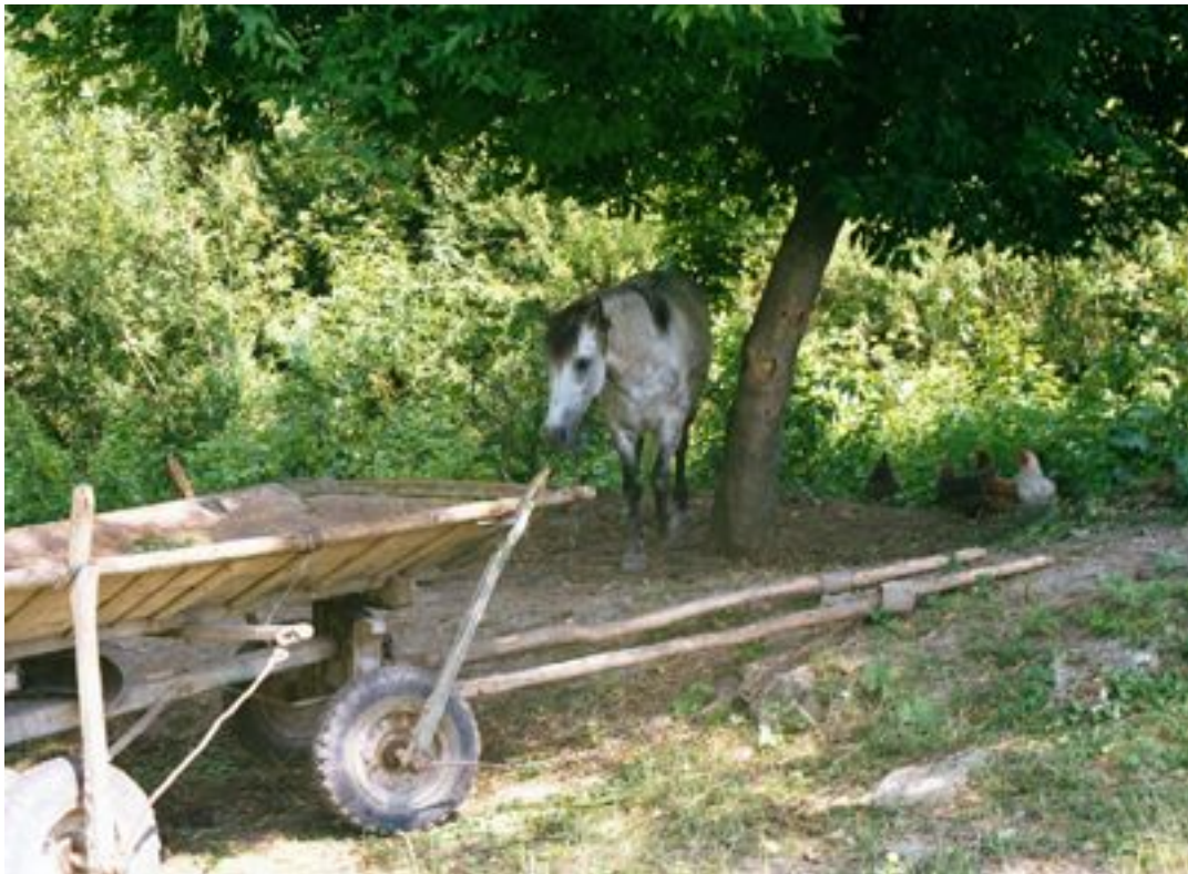
A horse and cart by the Ushitsa River, transported from the pages of Sholem Aleichem.