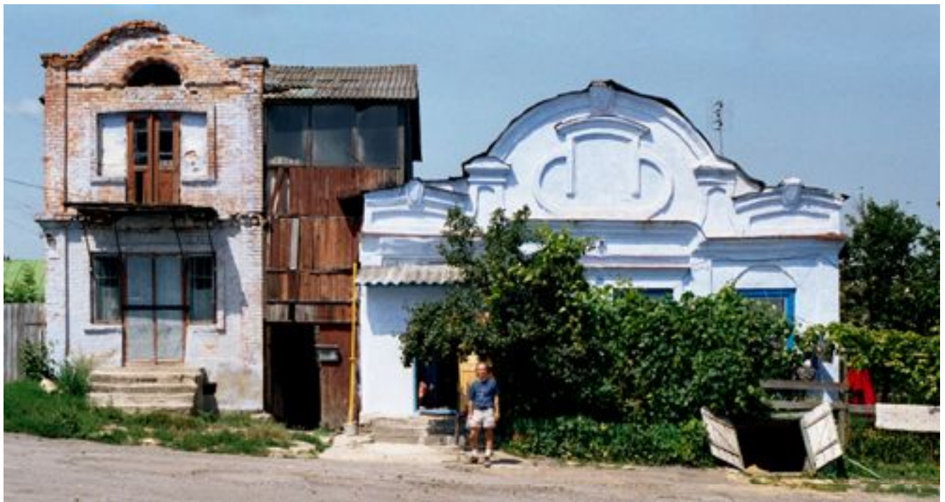
The blue house. The left side, now in disrepair, sports the original pre-war façade.