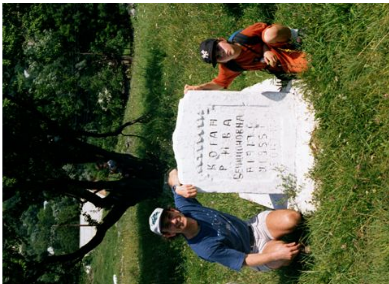
Grave of ריבא בנימיונא קוגאן – Riva Benzionovna Kogan (née Aizen).