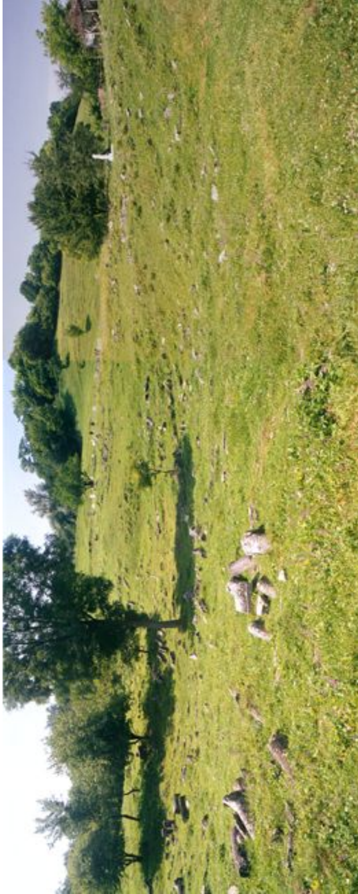
The Novaya Ushitsa Jewish Cemetery. Postwar graves are to the rear.