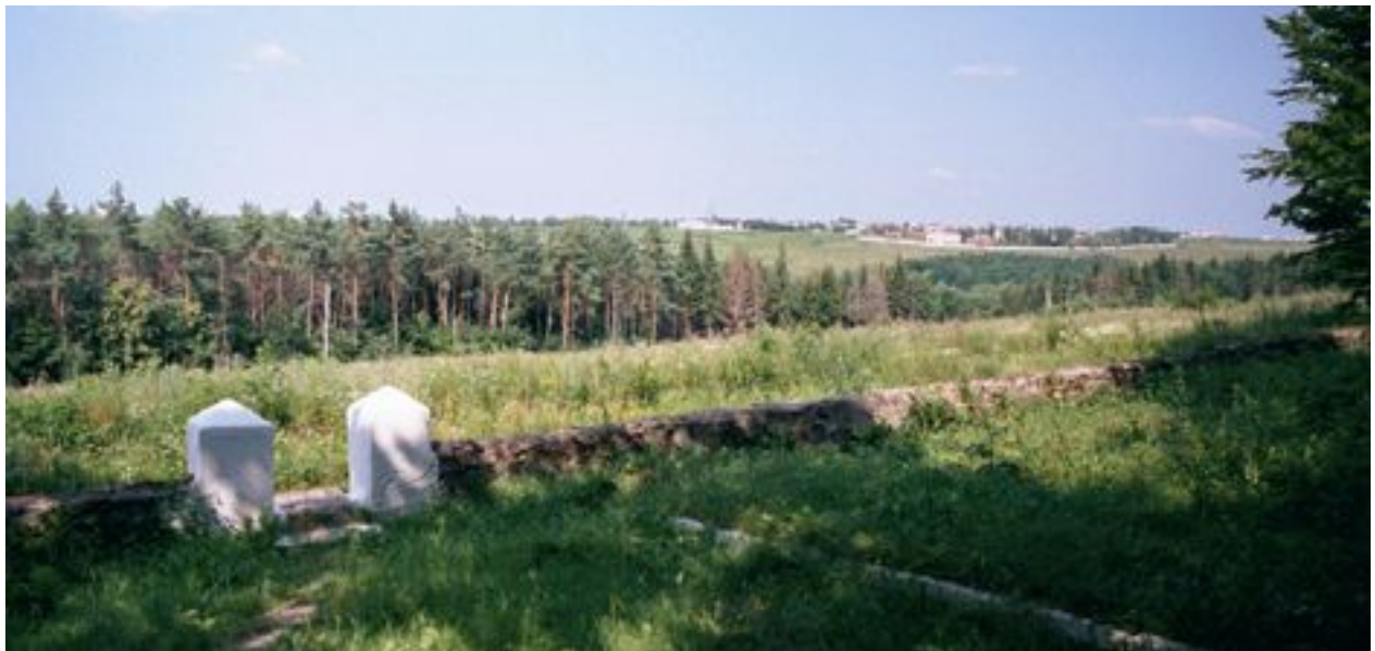
Looking outward from the memorial.