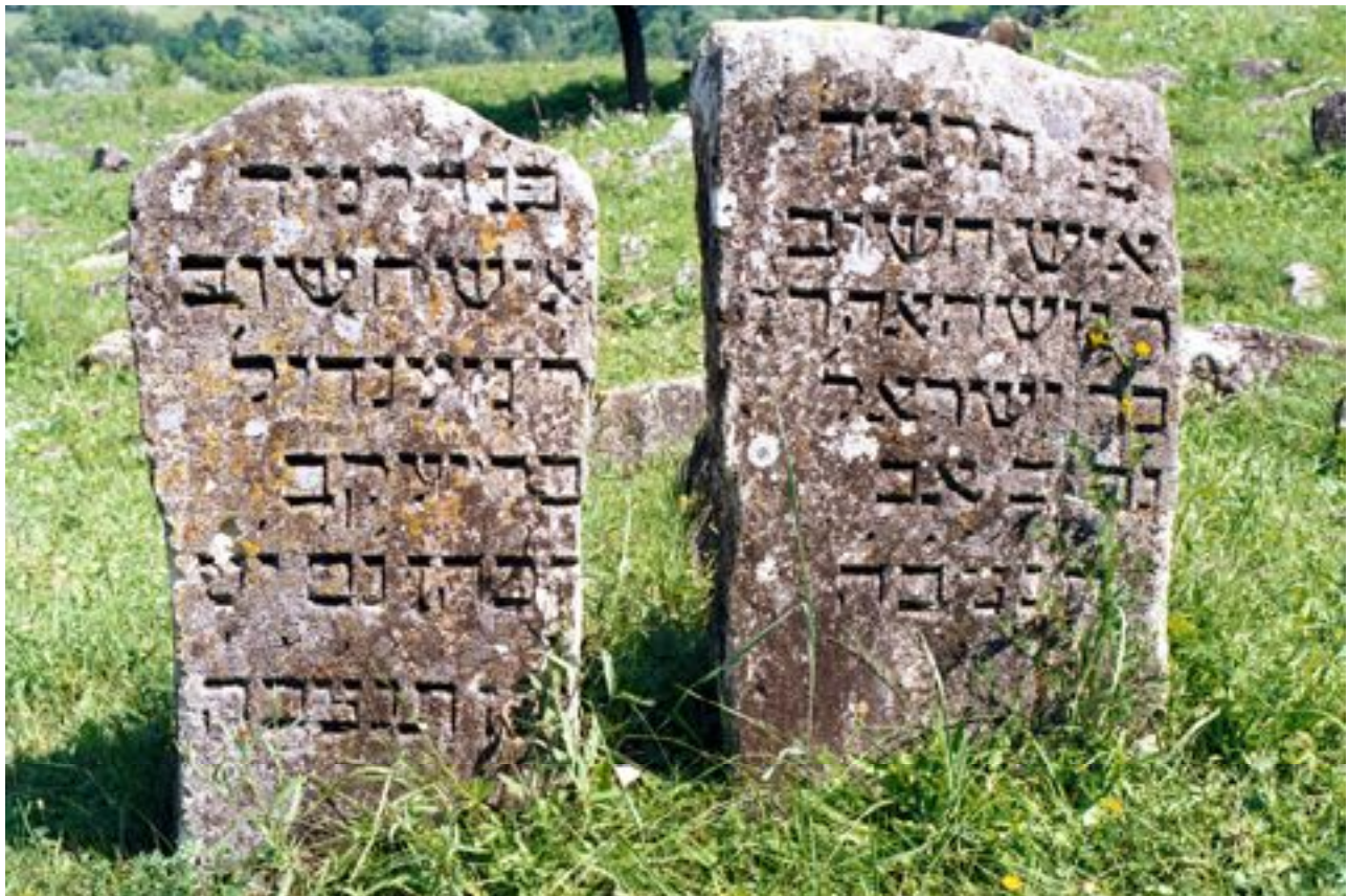
A pair of gravestones standing together.

Did the trees protect the stones from the Nazis? The Petliurans? Or were the trees just recent arrivals?