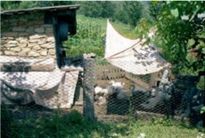
A farmhouse and avian residents on the uphill side of the road to the cemetery.