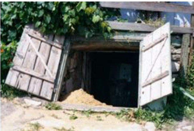
The root cellar below the blue house.