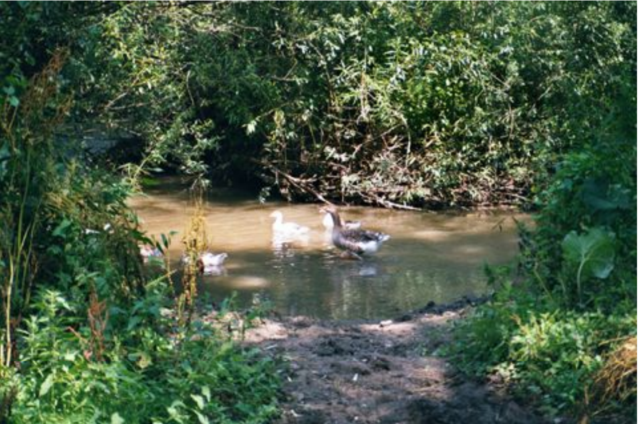
The Ushitsa River.