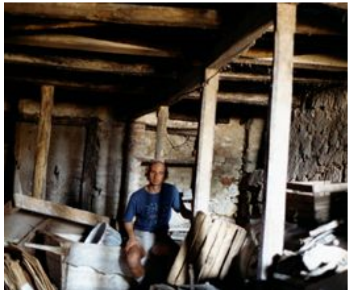
Low-light picture inside the root cellar.