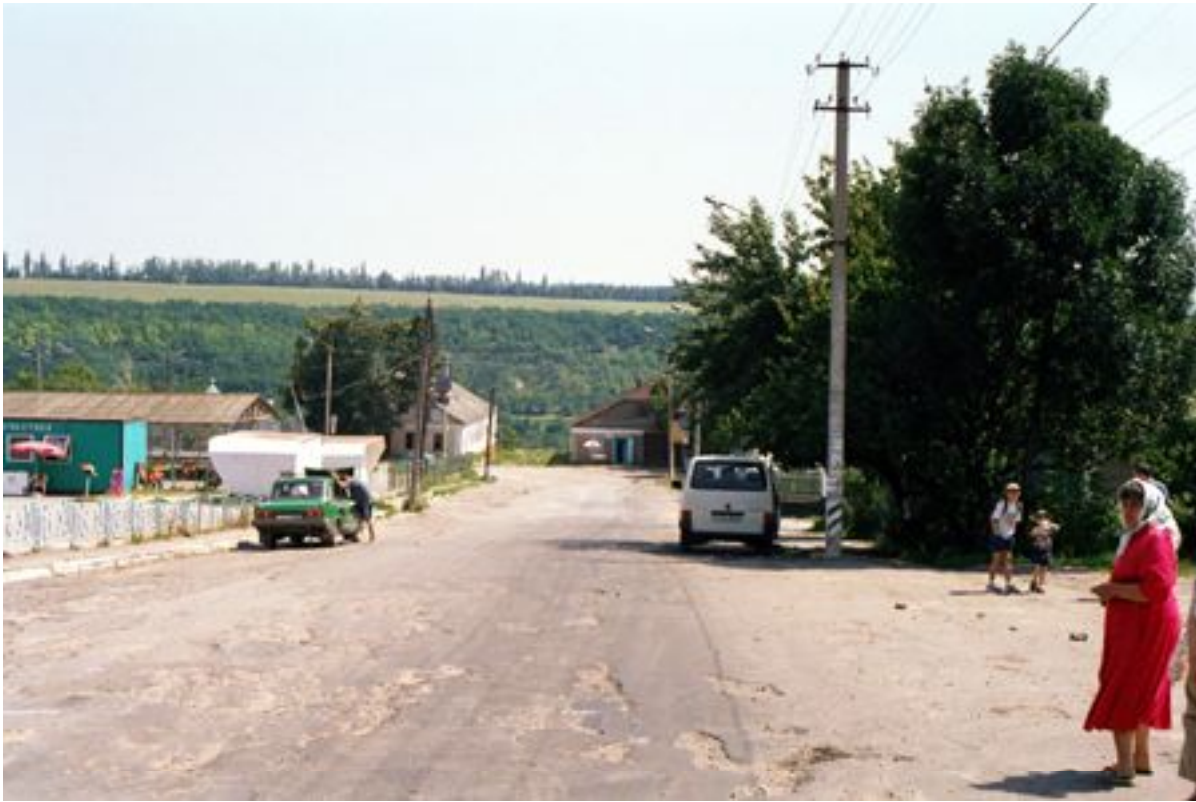
Looking down the main road of Novaya Ushitsa to the Ushitsa Valley. Manya Grinberg's daughter is on the right. The big market square is on the left. The courtyard with synagogues is at the bottom of the road to the right, and the road to the cemetery leads off to the left. Peter's white VW Vanagon is parked in the shade. The SS established the Jewish ghetto on the right-hand side of the road.