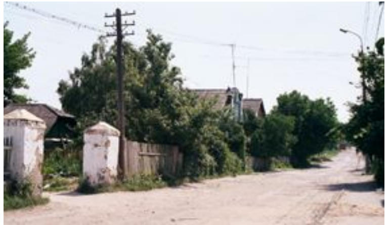
Side street running south from the main street. The house picture to the left is just beyond the white gateposts.