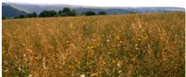
More views on the way to Novaya Ushitsa.