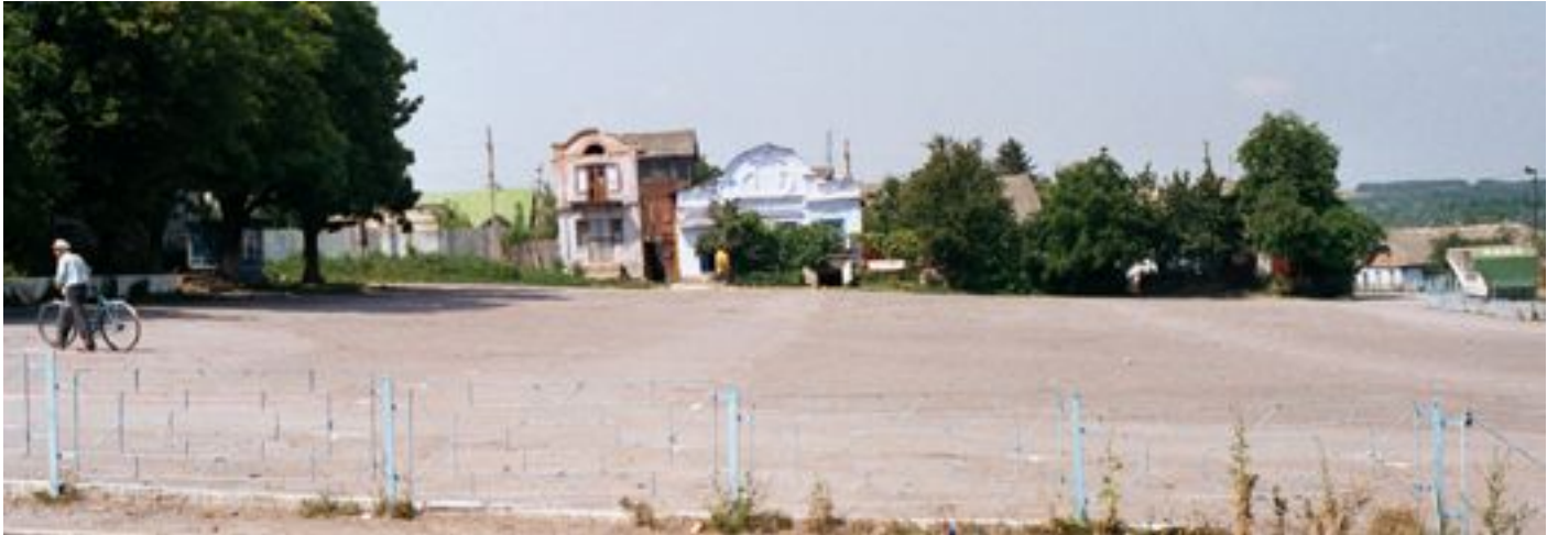
The blue house across Market Square.