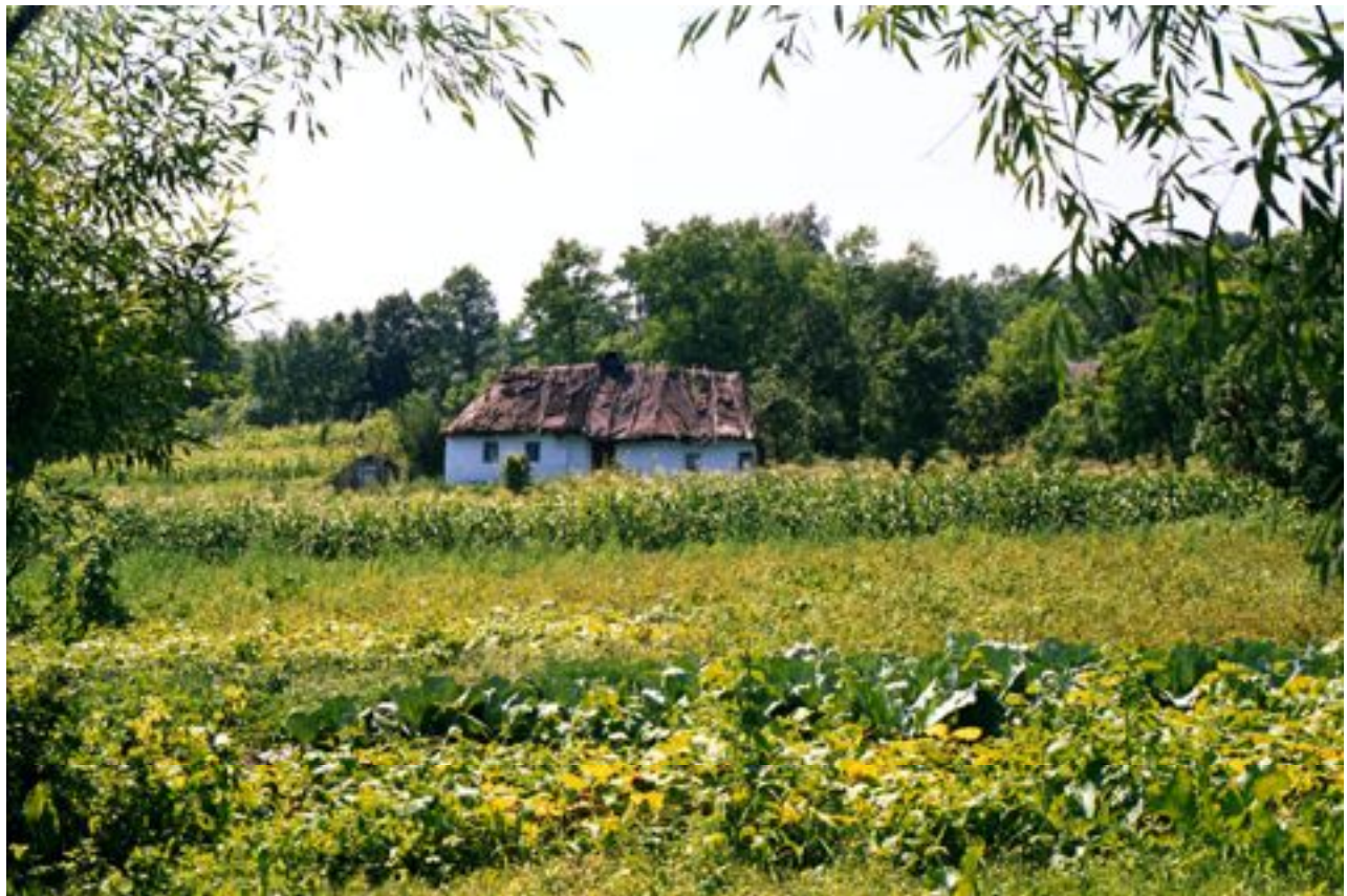
Farmhouse with a thatched roof on the way to the cemetery.