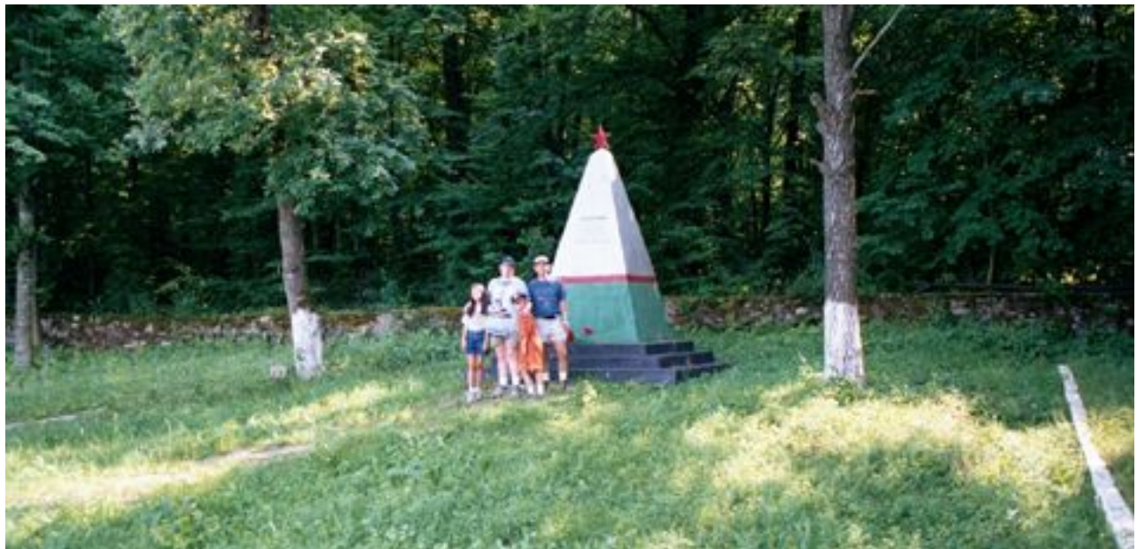
Memorial for murdered Jewish residents of Novaya Ushitsa at the mass execution site in Trikhov Forest.