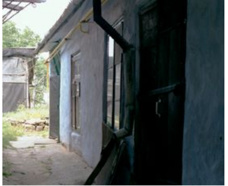
Alley separating the halves of the blue house.