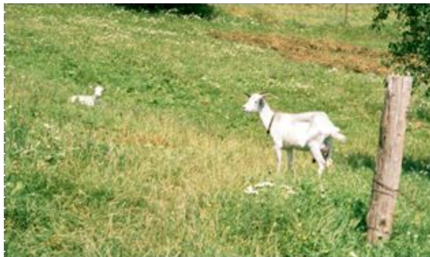
Another installment of "The Goats of Podolia" on the way back from the cemetery.