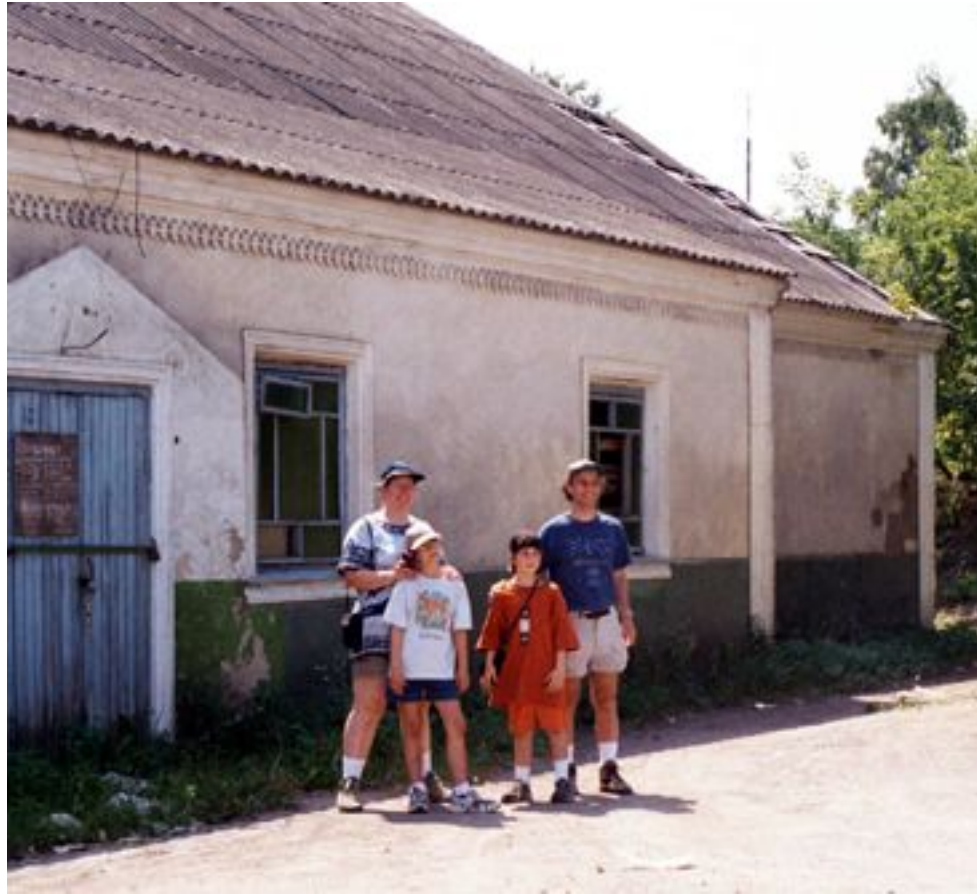
A second view of the working persons' schul.