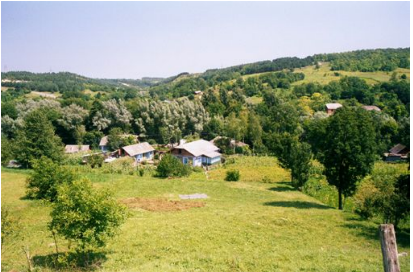
More Podolian homes below the road to the cemetery.