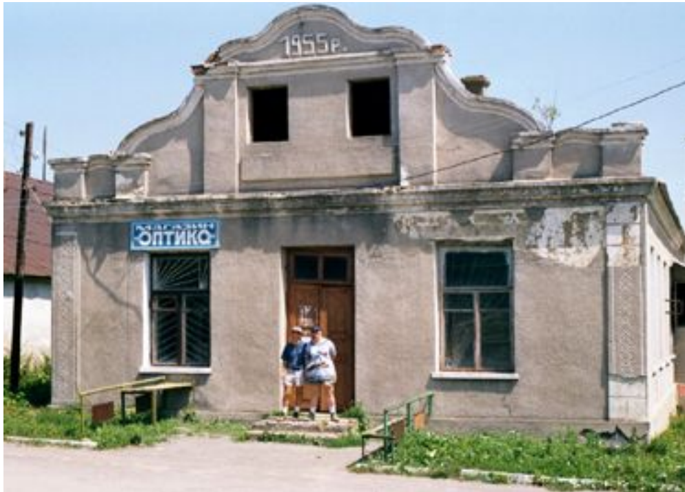
Rich persons' schul in Novaya Ushitsa. The sign says Optika magasin – Optics shop