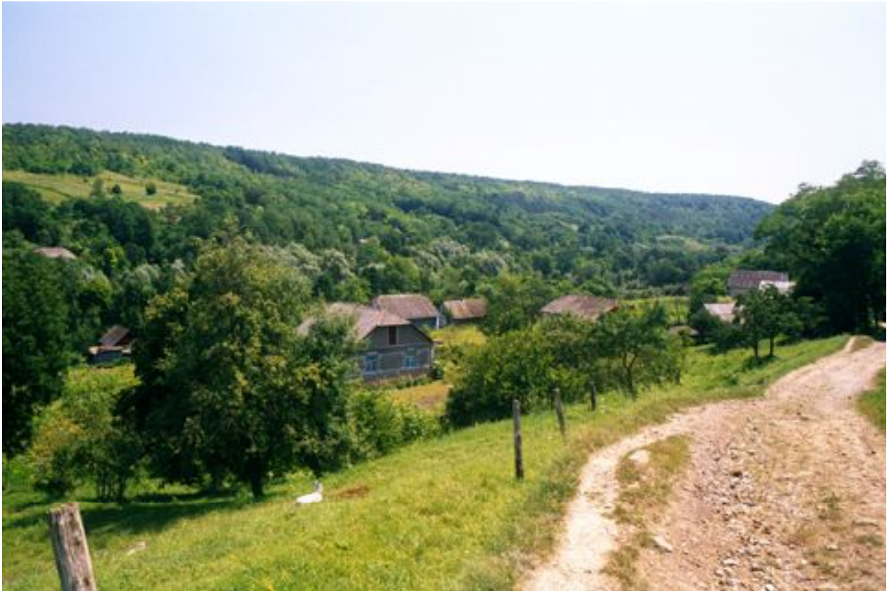
Looking back on the Ushitsa River Valley and the road to the cemetery.