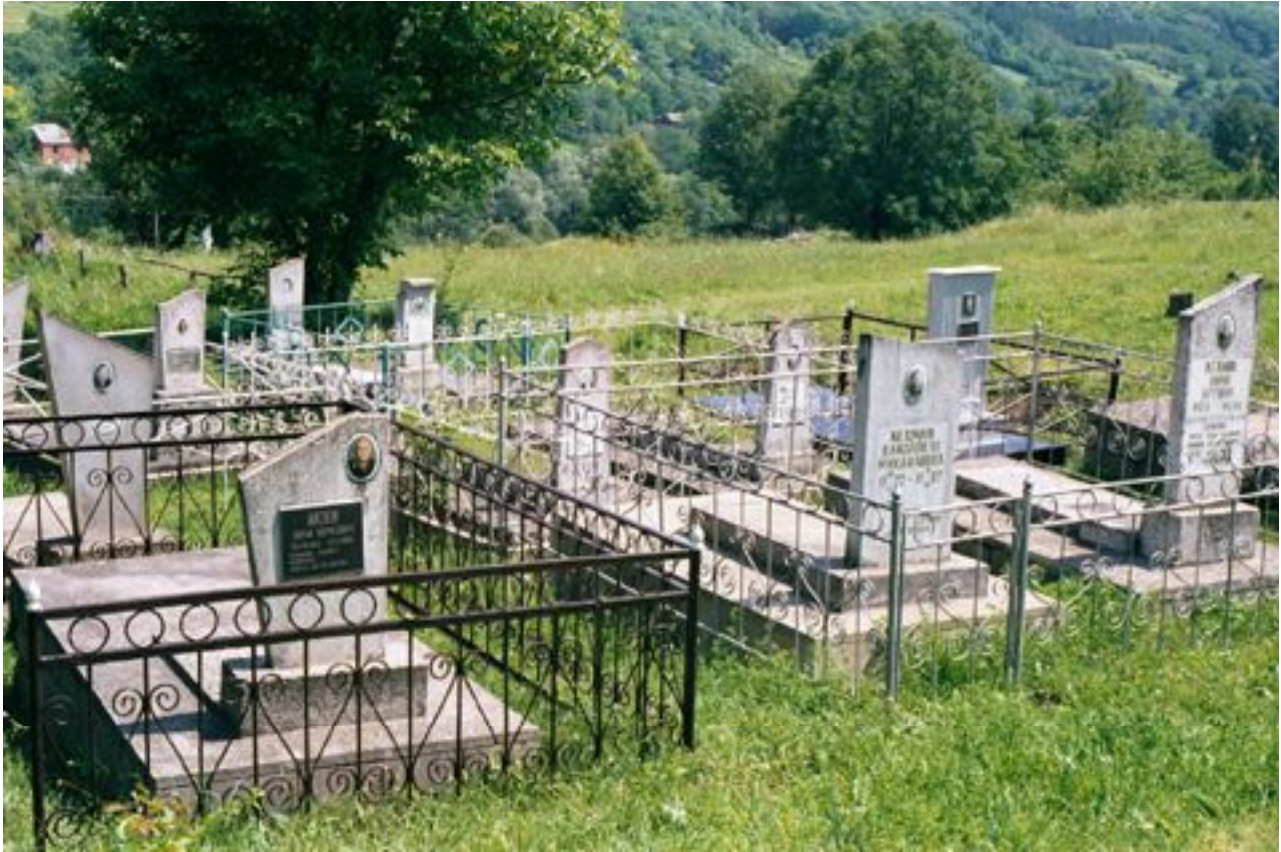
Post-Holocaust section of the Novaya Ushitsa cemetery.