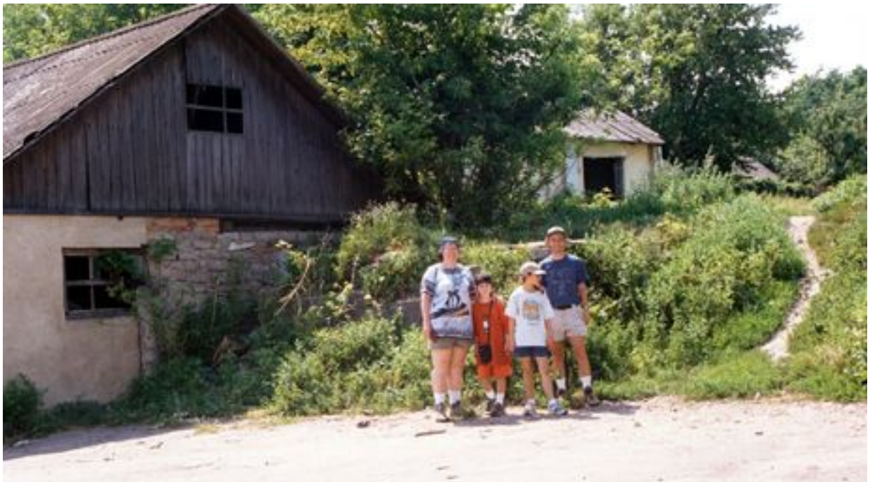
Foundation where the poor persons' schul used to stand.