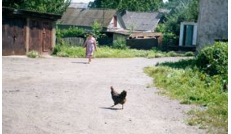
Reenactment of a very old riddle in Novaya Ushitsa.