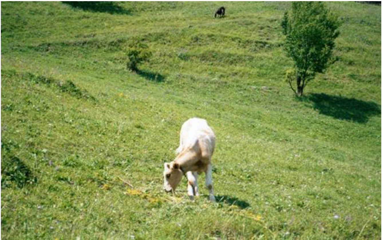
Cemetery maintenance: human and bovine.